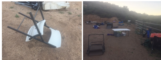
L to R: (1) The embedded chair that was dragged. (2) The equipment boxes, untouched.

The group eventually came to the site and we returned everything to the proper place. There was no other disturbance after that. Intuitively to me, it felt like a portal had opened.