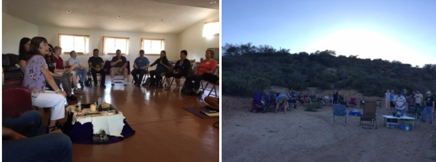
(L) The closing circle, Day 3. (R) Setting up our contact site, Day 1

Contact Report – September 28-30, 2018 Southern Arizona Retreat by Lyssa Royal Holt