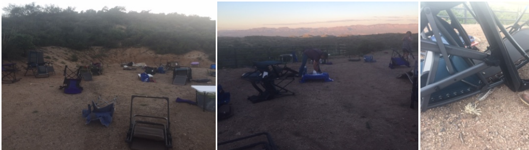
L to R: (1) The chaotic scene. (2) Ron fixes the altar. (3) The feather fan neatly tucked under tangled chairs

Patrick and Barb visited the site, in broad daylight, some type of chaotic energy had flipped over chairs (embedding some in the ground and dragging them), tangled chairs together, hid removable chair pieces, moved objects from the altar, folded some chairs neatly, gently hid our ceremonial feather fan under one chair without damaging it, and other assorted mayhem. However, all of our equipment (microphones, speakers, lights, etc.) were untouched. The weather was fair with no wind, and this site is secure. We would have seen any cars or people coming onto the property. (There were only a few workers on site, and we know they didn't do any of this). To me and several others, the energy felt like crop circle energy – like some force had been unleashed, or a portal had opened. On top of that, some of the channelings that Sasha and Hamón gave were deeply emotional for many, and helped to trigger emotional release. It was almost as if impersonal poltergeist energy had been activated. We didn't feel any negative intent at all, but the mystery was a bit exasperating (yet exciting). Little did we know that this was a precursor to some of the wild energy that went on that evening.