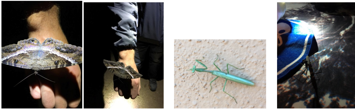
Our giant moth visitor, and the myriad “Founder” Mantis visitors, who love the attention and often groom themselves while we photograph them. The Mantis beings come every year, no matter our location.