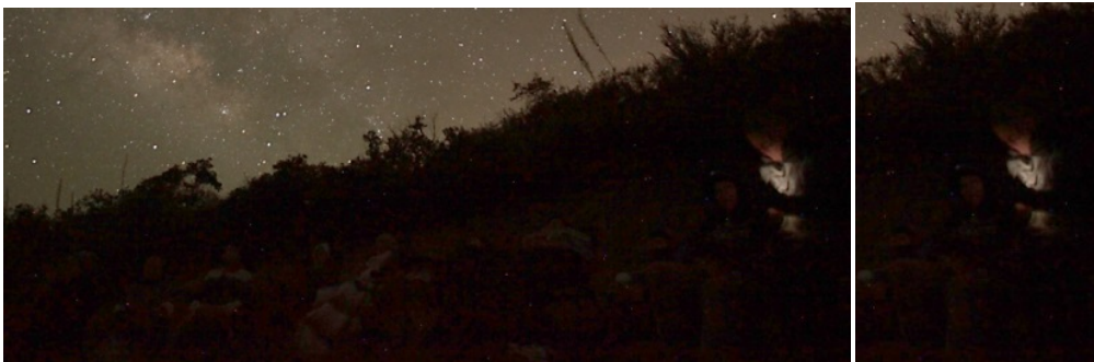
Photo of “Dr Mantis” taken in at the same site, May 2017.